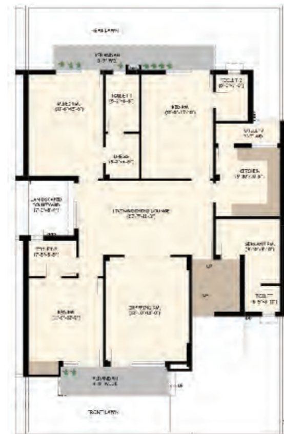
Ground Floor Plan Area = 1775 sq. ft.