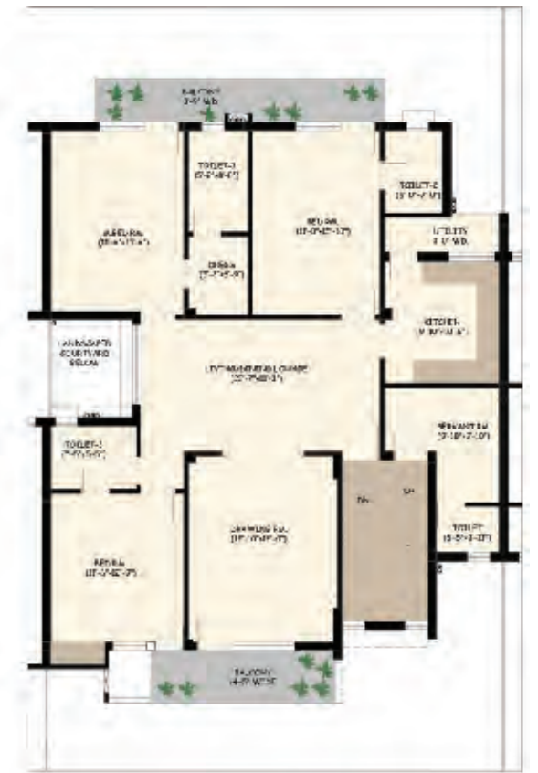
Second Floor Plan Area = 1775 sq. ft.