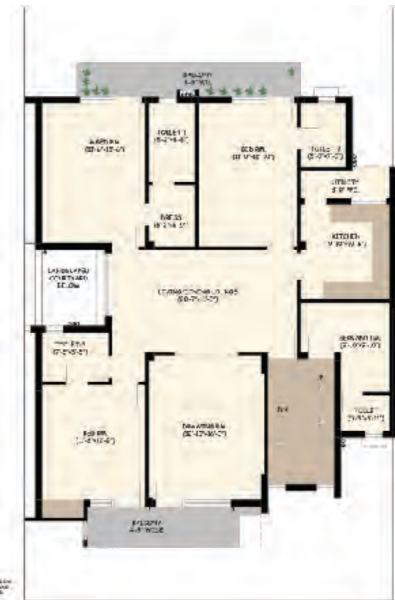
First Floor Plan Area = 1775 sq. ft.