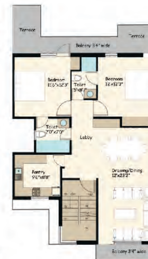
Second Floor Plan (Expandable) Area = 1128 sq. ft.