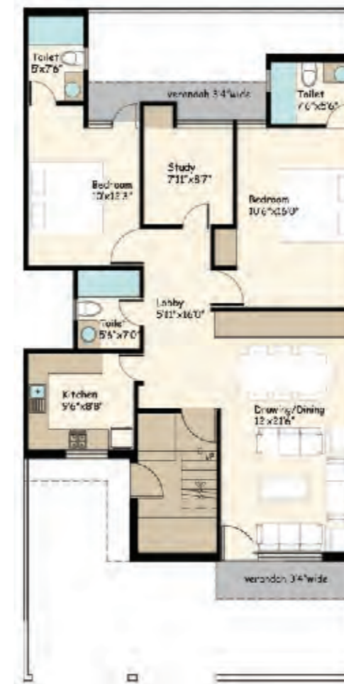
Ground Floor Plan Area = 1213 sq. ft.