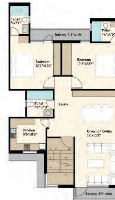
First Floor Plan Area = 1251 sq. ft.